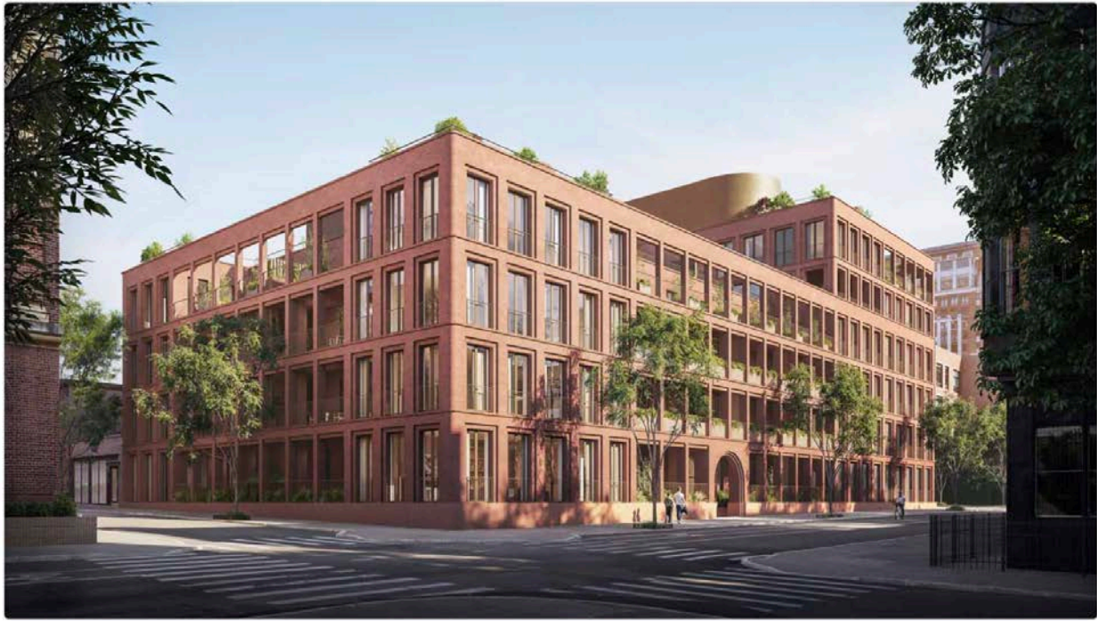
All renderings: © Darcstudio, courtesy of DADA Goldberg